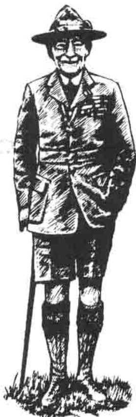
LORD BADEN POWELL

A scout should be ready at all times to solve many kinds of problems . For example, he ought to help people who are sick or hurt when there is no doctor. The scout motto is "Be prepared!"